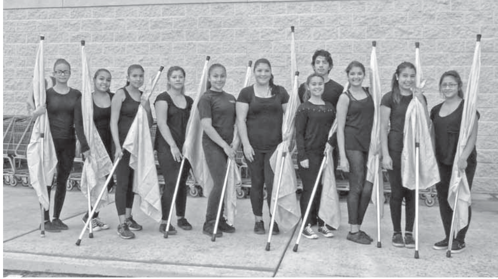
The Hawthorne High School Color Guard prepares to perform at the opening ceremonies.