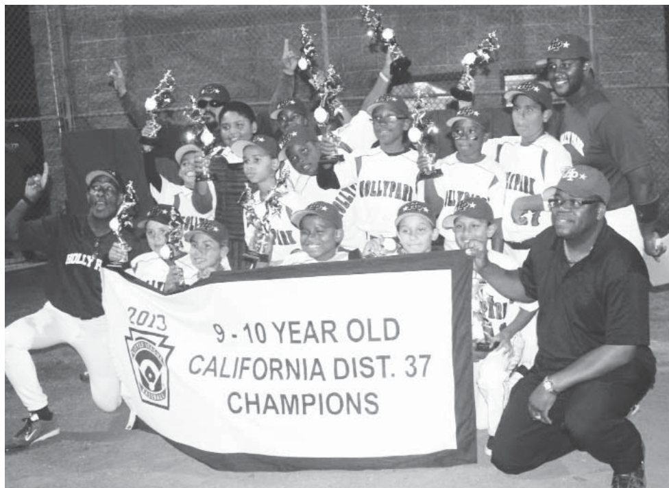
The Holly Park Minor Little League All-Star baseball team from Hawthorne captured the District 37 championship with an 18-4 win over host Westchester on July 10.