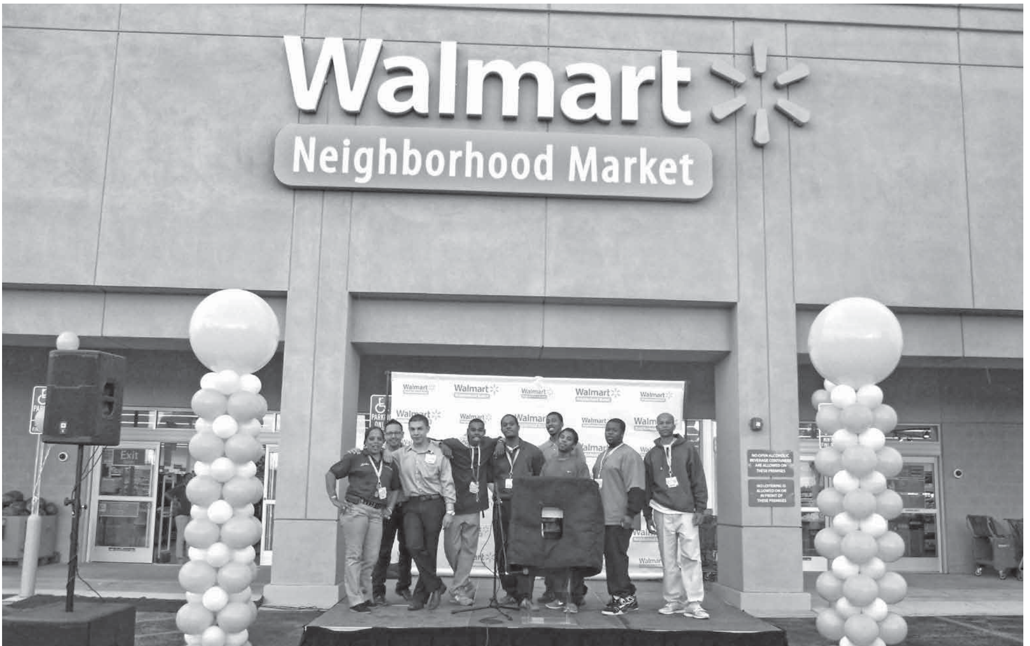
Some of the 65 newly hired Walmart Neighborhood Market employees proudly pose at the Hawthorne store’s grand opening event.