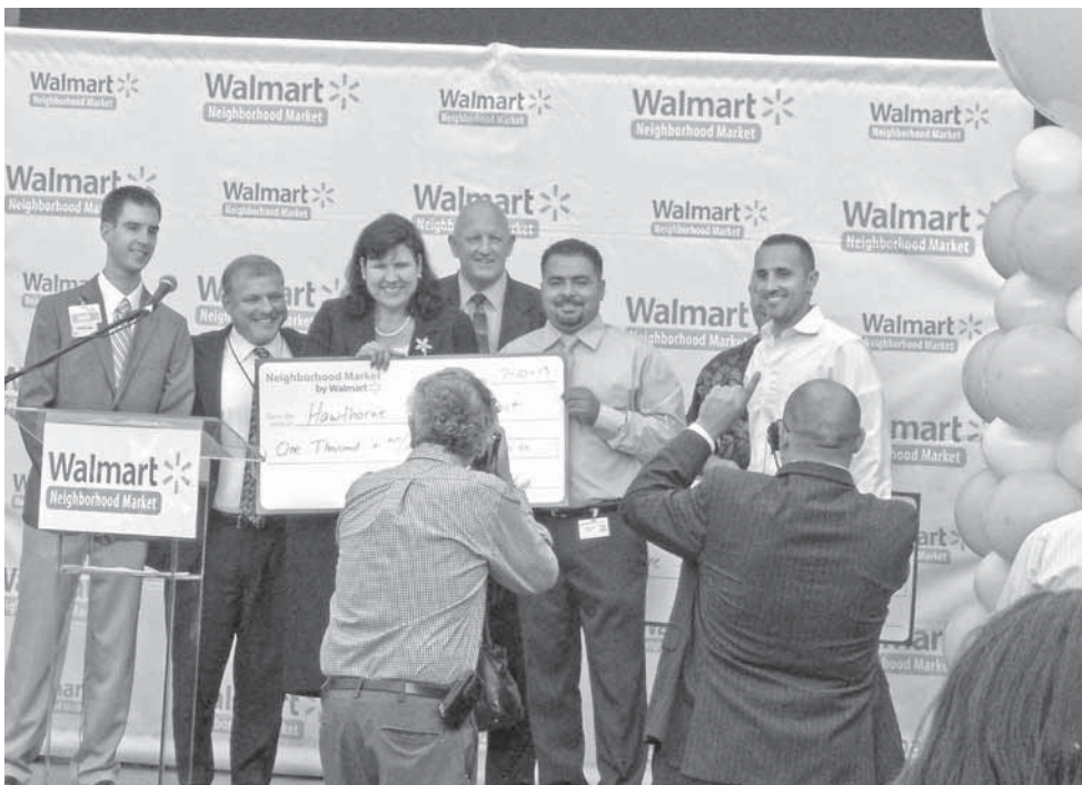
The grand-opening celebration included presentations of up to $8,000 in grants from Walmart and the Walmart Foundation to local community groups including Billy Mitchell School, Hawthorne School District, Hawthorne Navy Jr. ROTC, Hawthorne Kiwanis, South Bay Soccer Foundation, Hawthorne Police Department and Wounded Heroes.