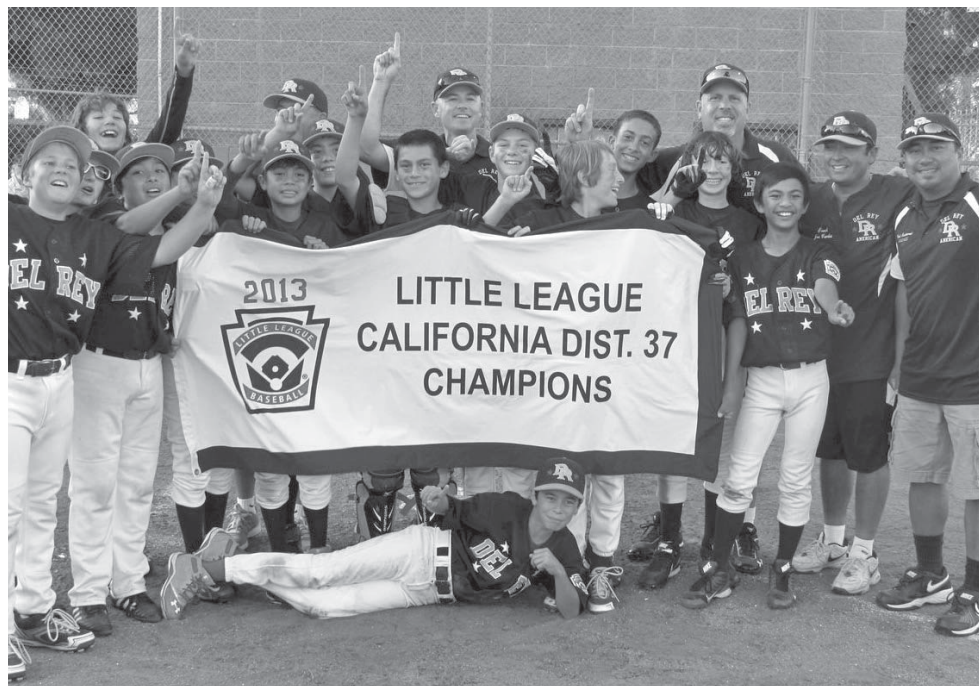
The Del Rey American Major (age 11-12) Little League All-Star baseball team takes home the District 37 championship banner with a victory over Holly Park on July 9.

The Holly Park Major (age 11-12) Little League All-Star baseball team was routed by Del Rey 11-0 in the District 37 championship game on July 9 at Nielsen Youth Sports Park in Westchester.